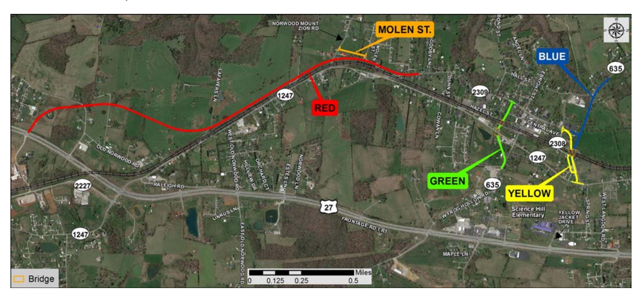
Figure ES-2: Alternatives Presented for Public Consideration

Based on costs, impacts, input from local officials and stakeholders, and more, the project team eliminated some of the initial alternatives and identified four to present to the public ( Figure ES-2 ). One or more alternatives from each geographic group was advanced, representing the best solution(s) within that group. Each alternative was renamed with a corresponding color for simplicity and ease of identification. A Molen Street Connector was considered alongside north and middle concepts.